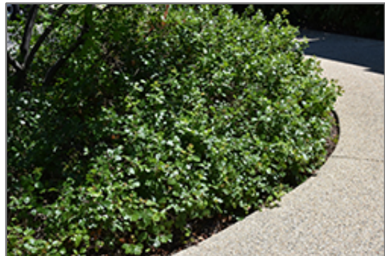
Gro-Low Fragrant Sumac

Gro-Low Fragrant Sumac is recommended for the following landscape applications;