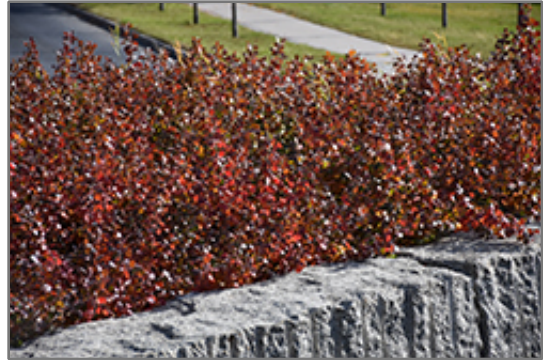
Gro-Low Fragrant Sumac in fall

This shrub performs well in both full sun and full shade. It is very adaptable to both dry and moist locations, and should do just fine under typical garden conditions. It is not particular as to soil type, but has a definite preference for acidic soils, and is subject to chlorosis (yellowing) of the foliage in alkaline soils. It is highly tolerant of urban pollution and will even thrive in inner city environments. Consider applying a thick mulch around the root zone in winter to protect it in exposed locations or colder microclimates. This is a selection of a native North American species.