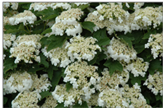
Compact European Cranberry flowers