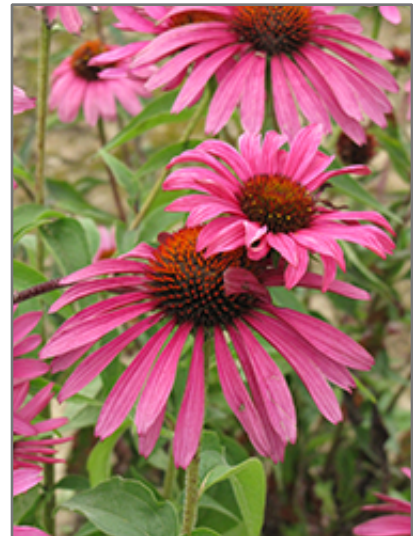
Ruby Star Coneflower flowers