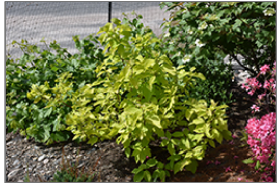
Neon Burst Dogwood