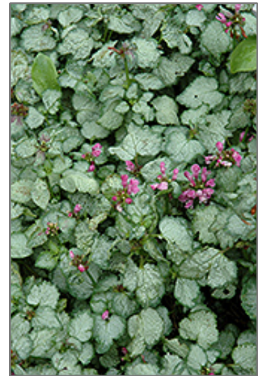
Beacon Silver Spotted Dead Nettle flowers