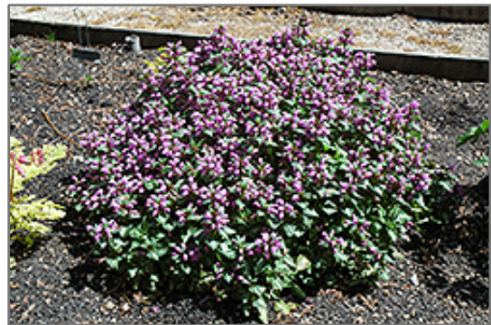
Beacon Silver Spotted Dead Nettle in bloom