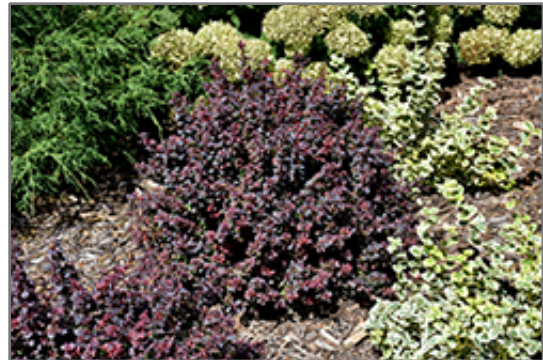
Sunjoy Todo Japanese Barberry