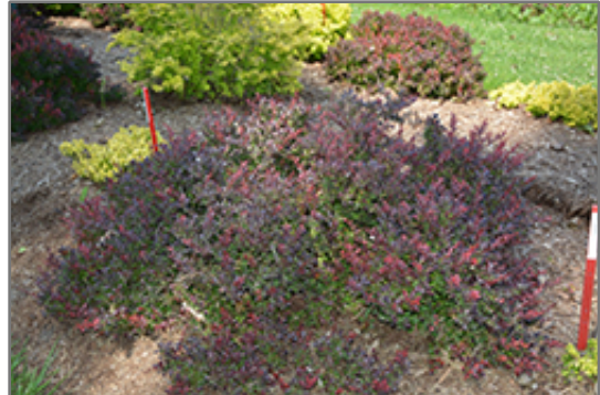
Sunjoy Todo Japanese Barberry

Sunjoy Todo Japanese Barberry will grow to be about 24 inches tall at maturity, with a spread of 24 inches. It tends to fill out right to the ground and therefore doesn't necessarily require facer plants in front. It grows at a medium rate, and under ideal conditions can be expected to live for approximately 20 years.