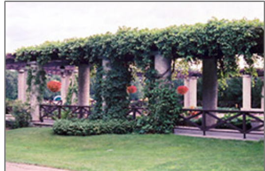
Virginia Creeper