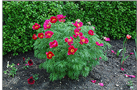
Fernleaf Peony in bloom