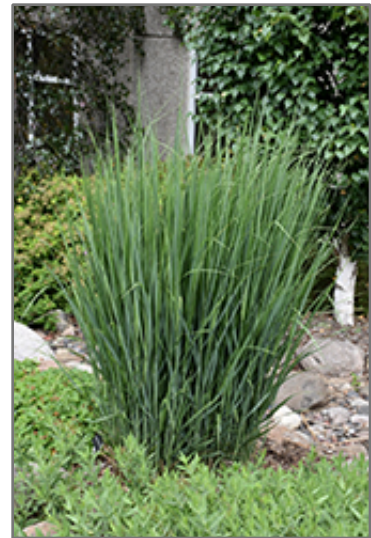
Northwind Switch Grass