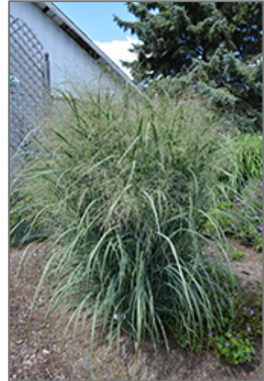
Northwind Switch Grass in bloom

This plant does best in full sun to partial shade. It is very adaptable to both dry and moist locations, and should do just fine under typical garden conditions. It is considered to be drought-tolerant, and thus makes an ideal choice for a low-water garden or xeriscape application. It is not particular as to soil type, but has a definite preference for alkaline soils, and is able to handle environmental salt. It is somewhat tolerant of urban pollution. This is a selection of a native North American species. It can be propagated by division; however, as a cultivated variety, be aware that it may be subject to certain restrictions or prohibitions on propagation.