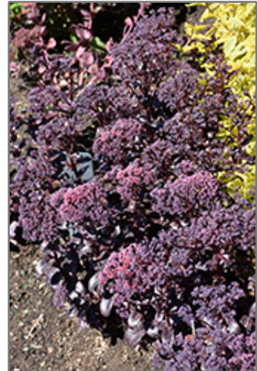
Dark Magic Stonecrop in bloom