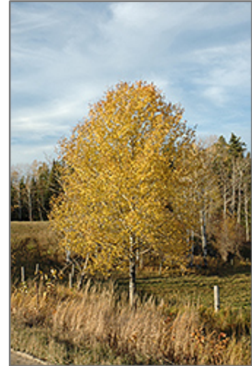
Trembling Aspen in fall

This tree should only be grown in full sunlight. It is an amazingly adaptable plant, tolerating both dry conditions and even some standing water. It is considered to be drought-tolerant, and thus makes an ideal choice for xeriscaping or the moisture-conserving landscape. It is not particular as to soil type or pH. It is quite intolerant of urban pollution, therefore inner city or urban streetside plantings are best avoided. This species is native to parts of North America.