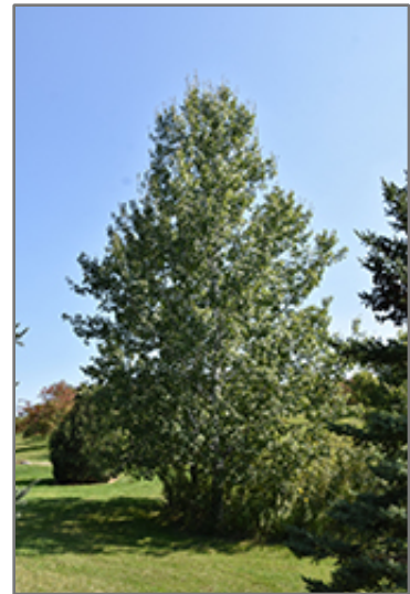
Trembling Aspen