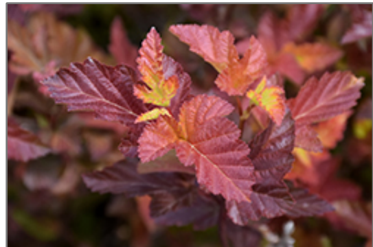
Center Glow Ninebark foliage

Center Glow Ninebark is recommended for the following landscape applications;