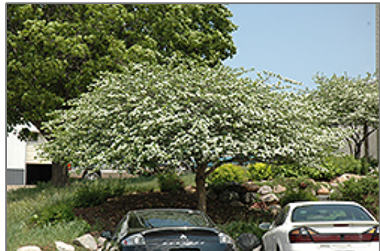
Thornless Cockspur Hawthorn in bloom