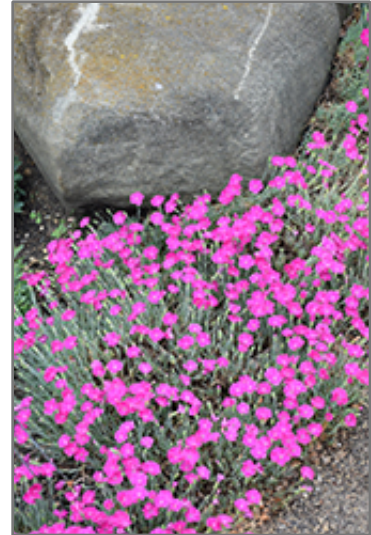
Firewitch Pinks in bloom

Firewitch Pinks is a fine choice for the garden, but it is also a good selection for planting in outdoor pots and containers. It is often used as a 'filler' in the 'spiller-thriller-filler' container combination, providing a mass of flowers and foliage against which the thriller plants stand out. Note that when growing plants in outdoor containers and baskets, they may require more frequent waterings than they would in the yard or garden. Be aware that in our climate, most plants cannot be expected to survive the winter if left in containers outdoors, and this plant is no exception. Contact our experts for more information on how to protect it over the winter months.