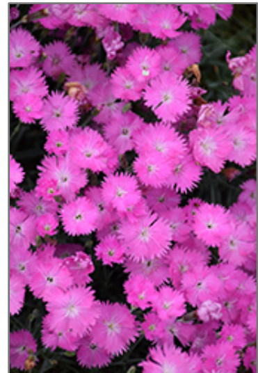
Firewitch Pinks flowers

Firewitch Pinks is recommended for the following landscape applications;