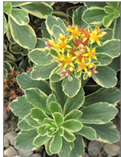
Variegated Russian Stonecrop flowers