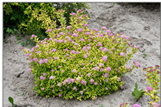
Sundrop Spirea in bloom