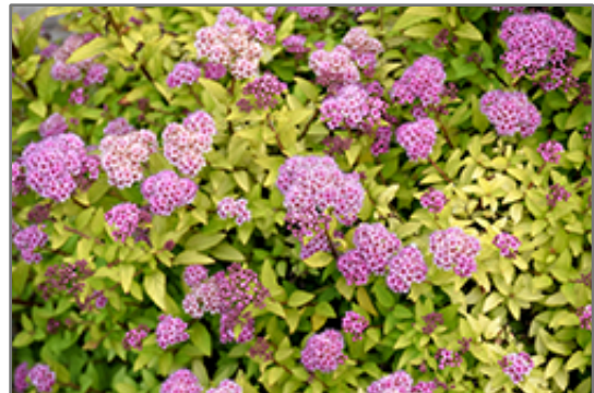
Sundrop Spirea flowers

Sundrop Spirea is recommended for the following landscape applications;