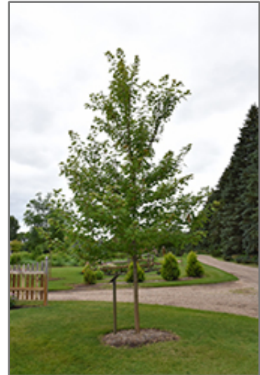
Matador Maple