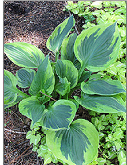
Twilight Hosta