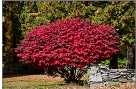
Winged Burning Bush in fall

Winged Burning Bush is recommended for the following landscape applications;