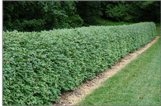
Winged Burning Bush

This shrub performs well in both full sun and full shade. It is very adaptable to both dry and moist locations, and should do just fine under average home landscape conditions. It is not particular as to soil type or pH. It is highly tolerant of urban pollution and will even thrive in inner city environments. This species is not originally from North America.