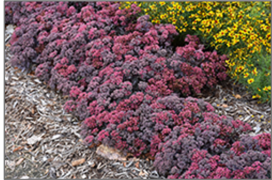
Dazzleberry Stonecrop in bloom