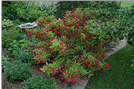
Red Prince Weigela in bloom