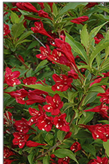
Red Prince Weigela flowers