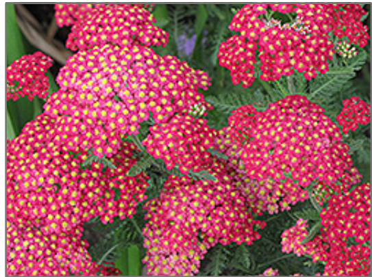
Galaxy Paprika Yarrow flowers

Galaxy Paprika Yarrow is recommended for the following landscape applications;