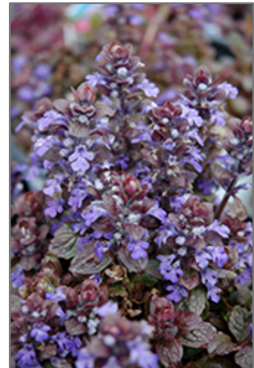
Bronze Beauty Bugleweed flowers

Bronze Beauty Bugleweed is recommended for the following landscape applications;