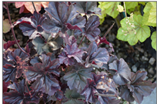
Obsidian Coral Bells foliage