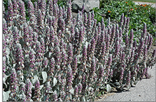
Lamb's Ears in bloom

Lamb's Ears will grow to be about 12 inches tall at maturity extending to 24 inches tall with the flowers, with a spread of 18 inches. When grown in masses or used as a bedding plant, individual plants should be spaced approximately 15 inches apart. Its foliage tends to remain dense right to the ground, not requiring facer plants in front. It grows at a fast rate, and under ideal conditions can be expected to live for approximately 10 years. As an herbaceous perennial, this plant will usually die back to the crown each winter, and will regrow from the base each spring. Be careful not to disturb the crown in late winter when it may not be readily seen!