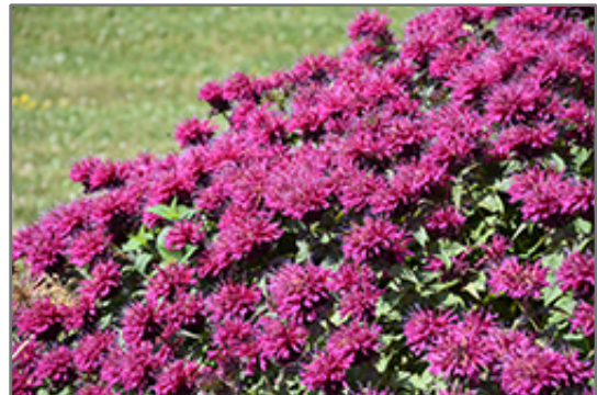
Grand Marshall Beebalm flowers

Grand Marshall Beebalm is recommended for the following landscape applications;