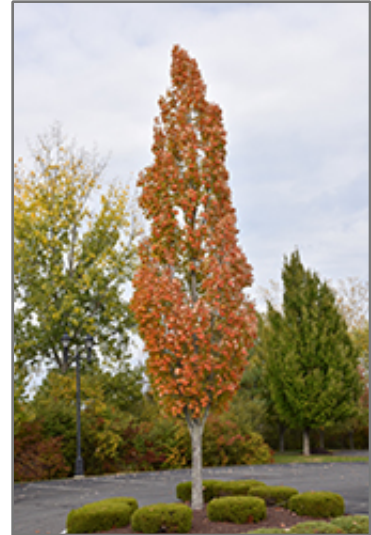
Armstrong Maple in fall

This tree should only be grown in full sunlight. It is quite adaptable, preferring to grow in average to wet conditions, and will even tolerate some standing water. It is not particular as to soil type or pH. It is highly tolerant of urban pollution and will even thrive in inner city environments. This particular variety is an interspecific hybrid.